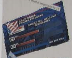
• The threat of immigration is real