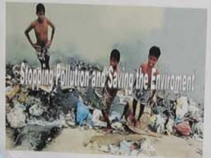
Stopping Pollution and Saving the Environment