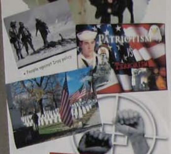
• People against Iraq policy