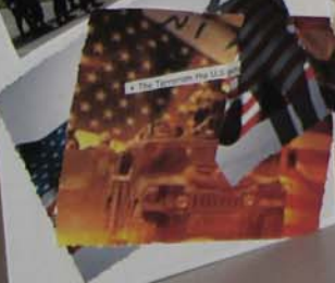
• Terrorism in the U.S.