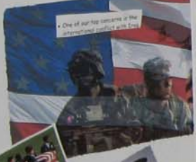
• One of our top concerns at the international conflict with Iraq