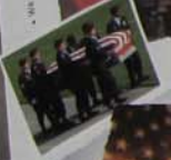
• We need to have a strong program